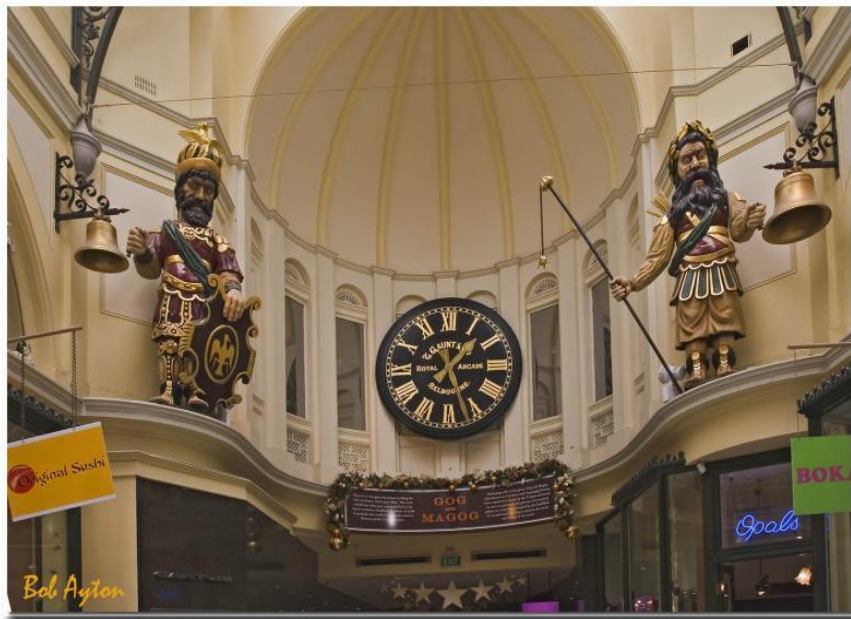
Gog & Magog, Royal Arcade, Melbourne

Now, if Gog and Magog et al, are not the forces during the Great Tribulation which comes against Israel, then who composes the end-time Beast power? Separate papers and booklets are available on this topic at www.friendsofsabbath.org and various Church of God websites.