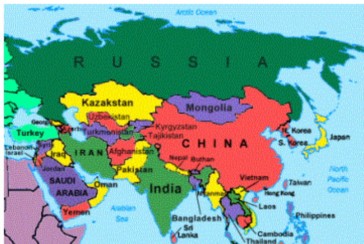
Locations of the descendants of Japheth today

Just as God gives us enough time to repent or show our true colours; just as He allowed Lucifer plenty of time to foment rebellion; so He will allow these forces to develop. The picture we get that these peoples are led by the forces that invaded the nations comprising the Beast power in Europe. As such, they no doubt comprise the remnants of the 200 million army pictured in Rev 9:16.